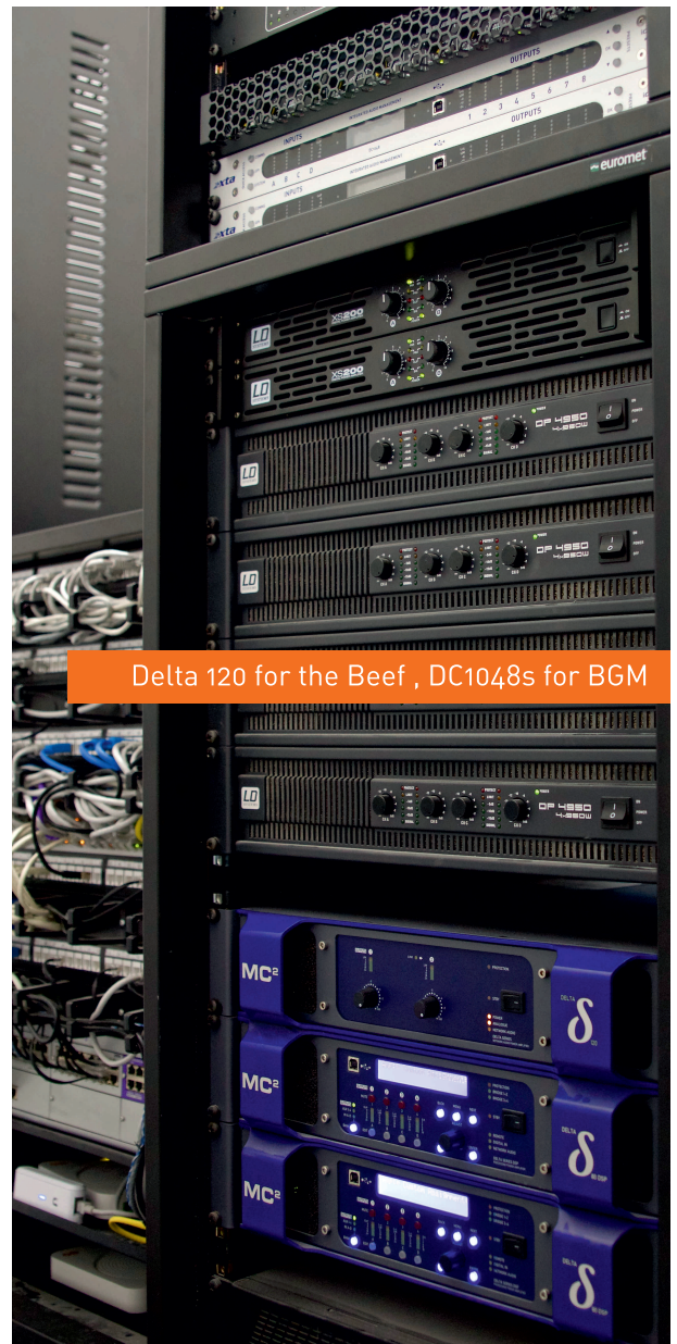
Delta 120 for the Beef , DC1048s for BGM

The eight aux outputs across the two Delta 80 DSPs could then be used very cost effectively to provide processed and protected audio to the smaller outdoor parts of the system through the use of existing amplifier stock.