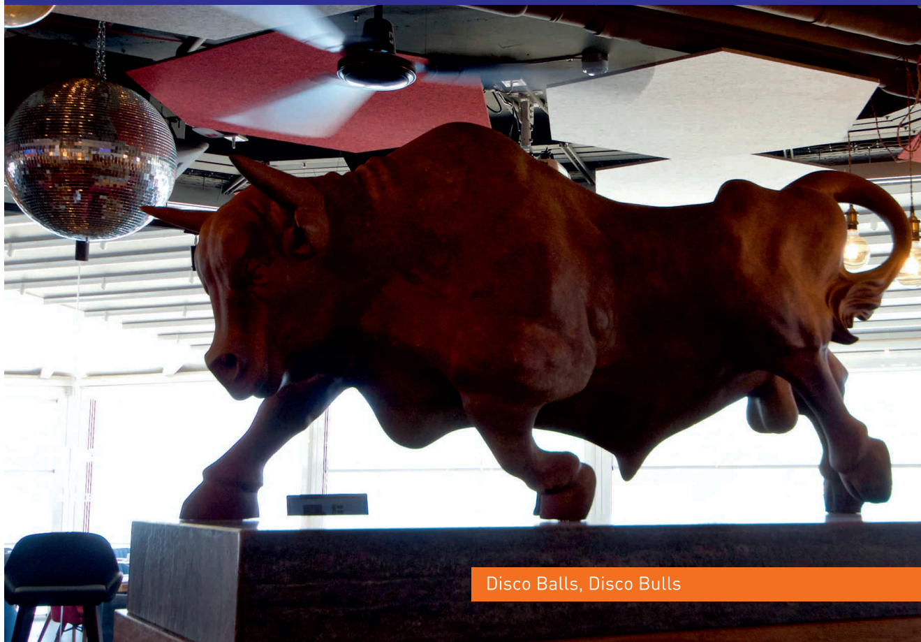
Disco Balls, Disco Bulls