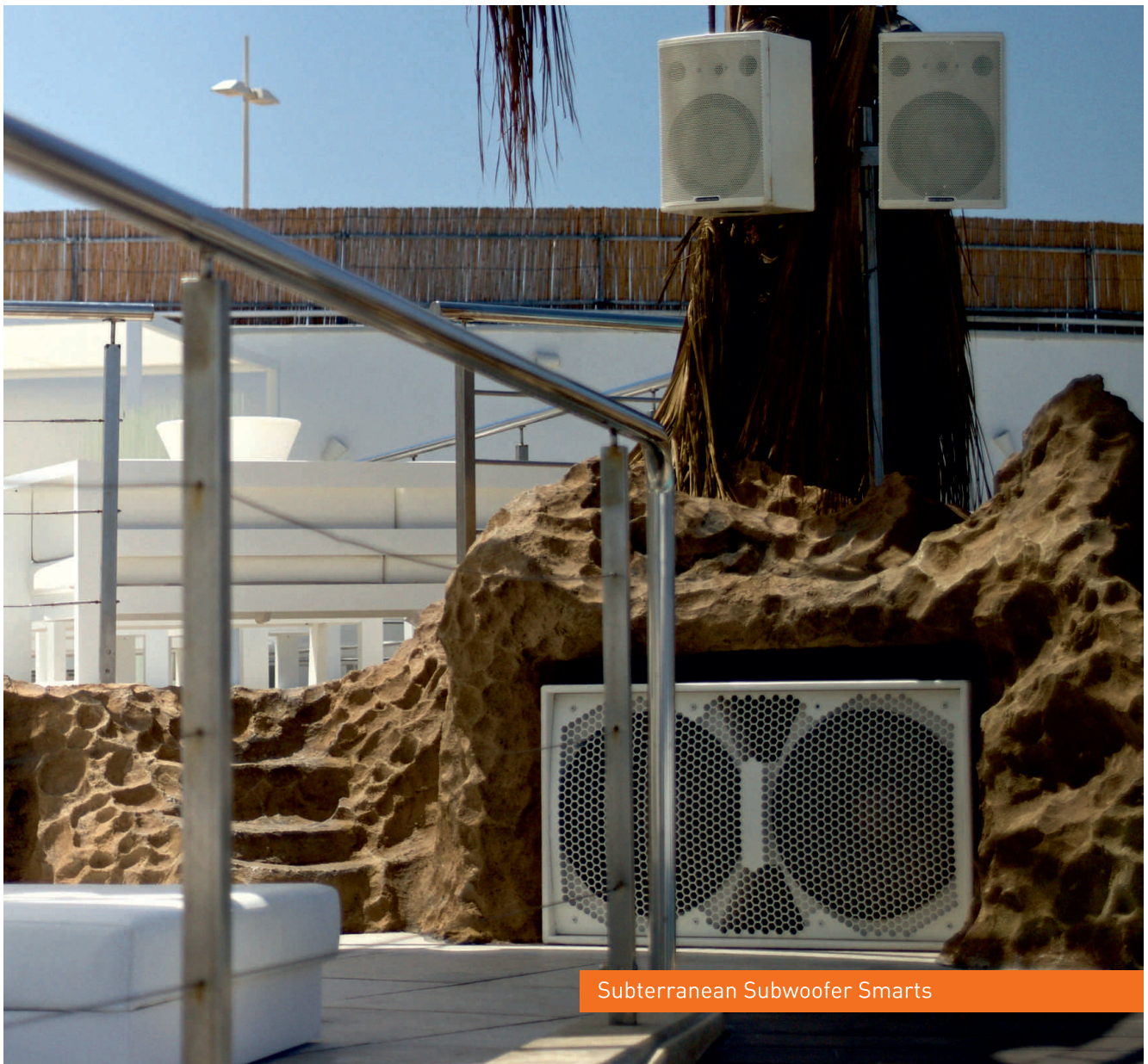
Subterranean Subwoofer Smarts

Stefan highlighted the ability of the DC1048s to automatically switch configurations using their built-in calendar and scheduling: