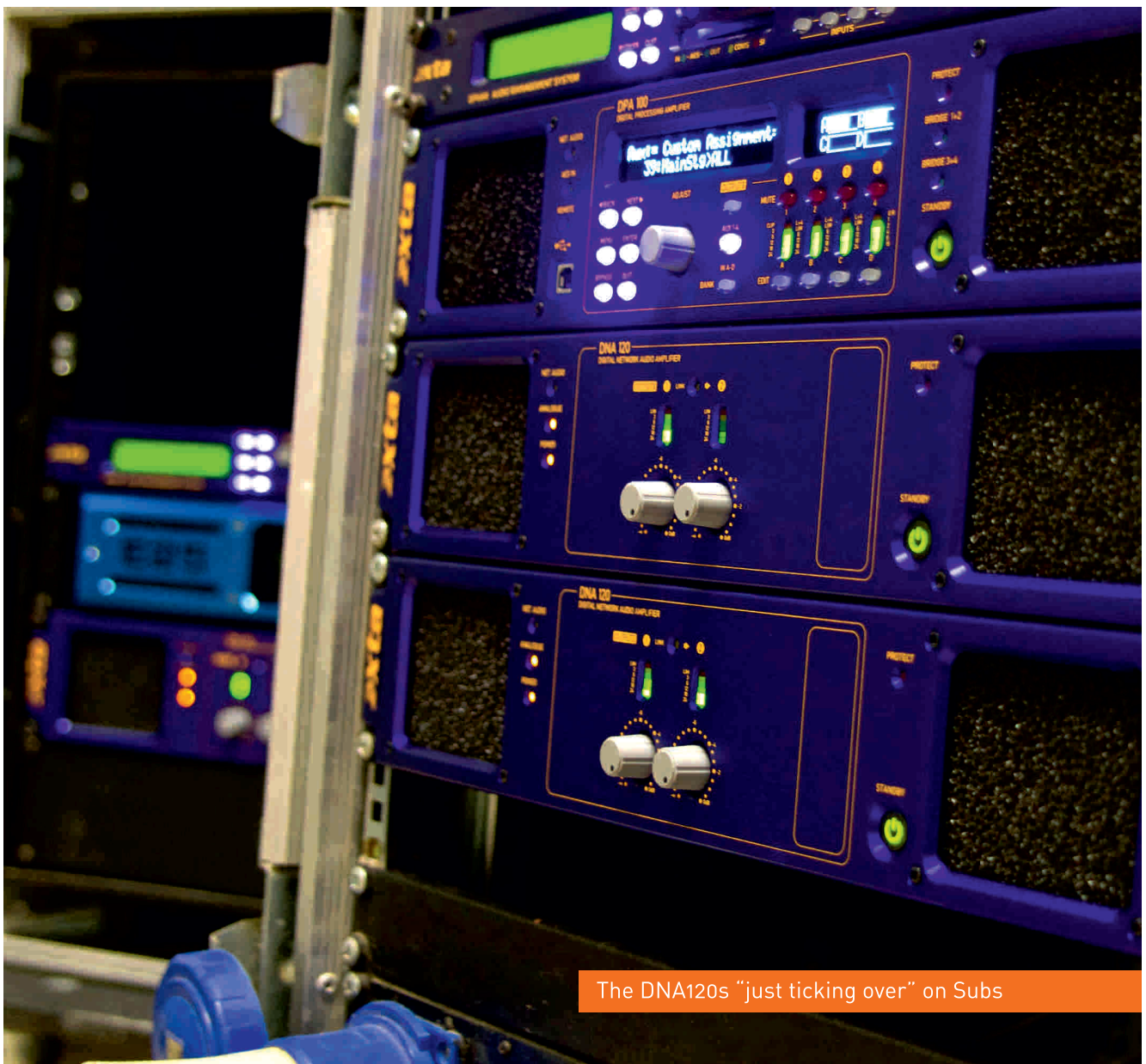
The DNA120s “just ticking over” on Subs